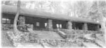
Bathhouse Park Center

Since 1999, the Friends have taken an active role assisting the Park Rangers in improving our park and in developing activities.