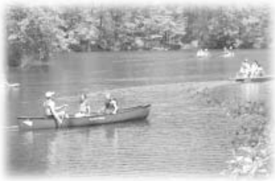
Friend's Day event